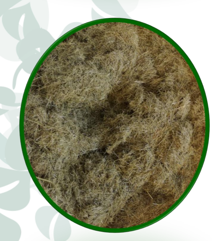
Hierochloe odorata before extraction